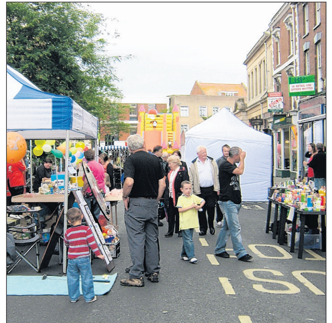
■ THE Summer Celebration day, held in Bridgwater High Street in July.

Below is a list of what has been going on over the summer and autumn to help the shoppers in Bridgwater.