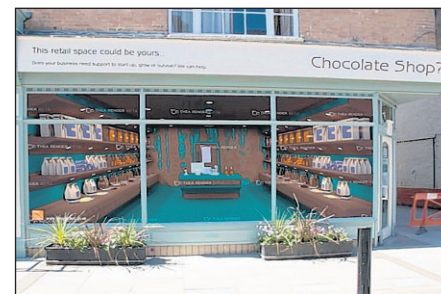
■ THE former Bridgwater Bookshop building in High Street was given the "Shop Jacket" treatment – a fake front designed to entice prospective purchasers by showing what it could look like if a business took it over. ■ The treatment seems to have worked – a planning application has now been submitted to turn it into a café/restaurant.